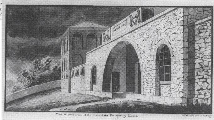
"View in Perspective of the Gate of the Penitentiary House"