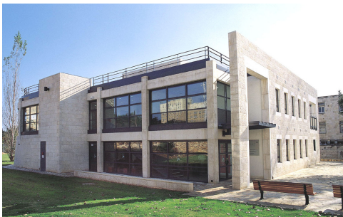
Meyerhoff Center , Hebrew University Campus, Jerusalem, Israel Completed 2000