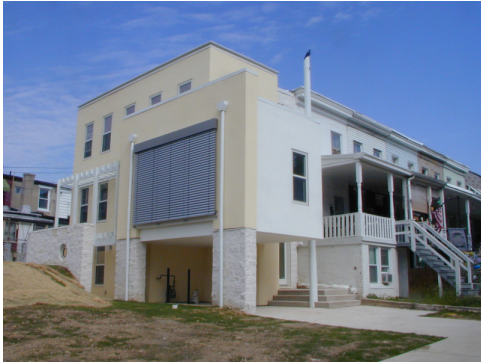
Residence at Lot 107 , 3418 Roland Avenue, Baltimore, Maryland Completed 2005

Designed for speculative re-sale, this house includes full living facilities, carport, three bedrooms, and three bathrooms in 1445 square feet. The bulk and massing of adjacent traditional row-homes were maintained, but the materials are borrowed from contemporary commercial architecture: EIFS and split-face CMU.