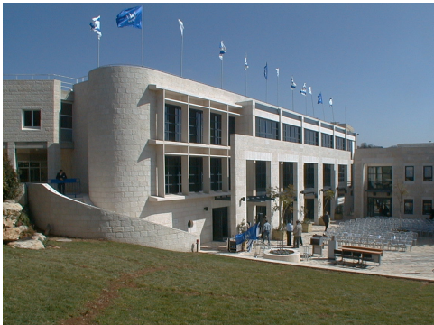
Cfar haNoar , Hebrew University Campus, Jerusalem, Israel Completed 2005