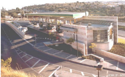
Alon Service Station , Kibbutz Ramat Rahel, Jerusalem, Israel Completed 2000

JK: Project Architect for Schocken Architects (all design, contract documents, and site supervision)