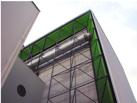
KBA Press Extension , HaAretz Press Facility, Tel Yitzhak, Israel Completed 2002

JK: Project Architect for Schocken Architects (all design, contract documents, and initial supervision)