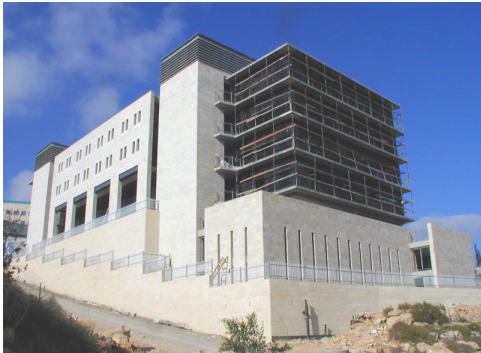
Minicom Company Headquarters , Har Hotzvim, Jerusalem, Israel Completed 2001

This building was custom-designed to include R&D, manufacturing, shipping/receiving, and management offices for the Minicom Company, makers of electronic video devices. The facilities include eating facilities and parking on three subterranean levels. Total area amounts to approximately 36,000 square feet of usable space and 40,000 square feet for parking.